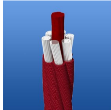
Climbing Net - 20 mm