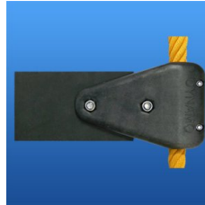
Jumping Surface Connector