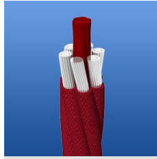
Climbing Net - 20 mm