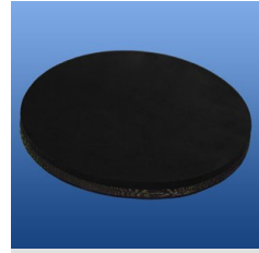
Jumping Surface Material