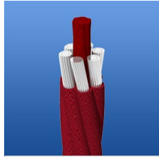
Climbing Net - 20 mm