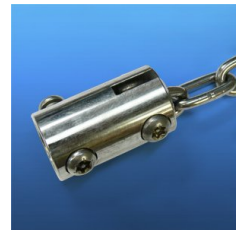
Biggo Seat Connector