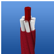
Climbing Net - 20 mm